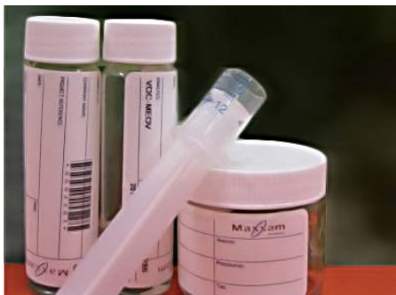
VOC methanol kit

IATA training and certification may be procured through designated third party companies specializing in national and international transportation of dangerous goods and hazardous materials. Organizations providing dangerous goods training in Canada can be found on Transport Canada's website: http://wwwapps.tc.gc.ca/saf-sec-sur/3/train-form/search-eng.aspx . Alternatively, the services of a third party TDG Consultant can be employed to assist and offer guidance with processing DGs for transport.